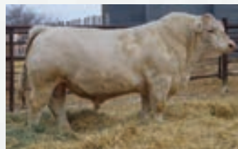
MATERNAL GRANDSIRE SPARROWS SEMINOLE 927W