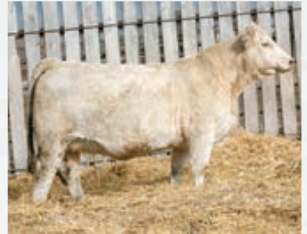
DAUGHTER STEPLER MISS 158J