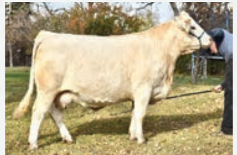
DAM STEPLER GABBY 546H

Retaining 1/3 interest Semex President Choice Breed Champion CWA 2022