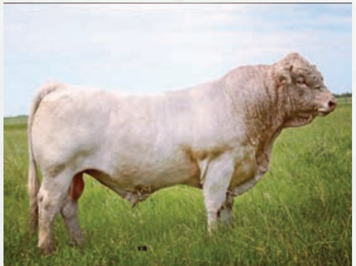
SIRE SPARROWS FLATLINER 971G

CE: 9.7 // BW: -0.9 // WW: 45 // YW: 97 // MILK: 29