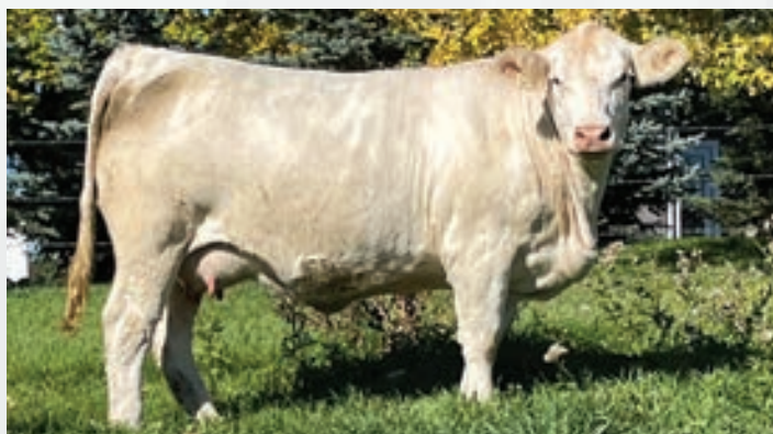
DAM STEPPLER MISS 52G

CE 2 BW 94 || ADJ WW 937 Retaining a 1/3 Semen Interest