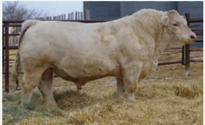
MATERNAL GRANDSIRE SPARROWS SEMINOLE 927W