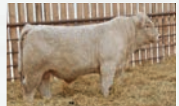
MATERNAL BROTHER STEPLER PEAKY BLINDER 29H