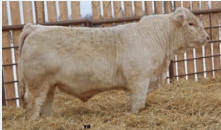
SIRE STEPLER GREAT WHITE 4H Working at ProChar Charolais and Lakeview Ranch, AB