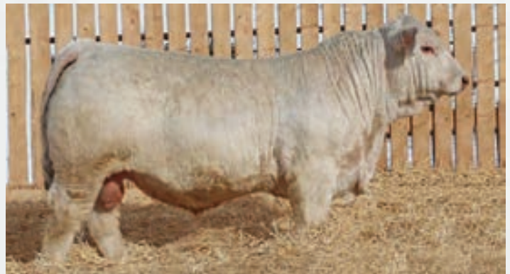
SIRE ELDER'S HOULIO 4H