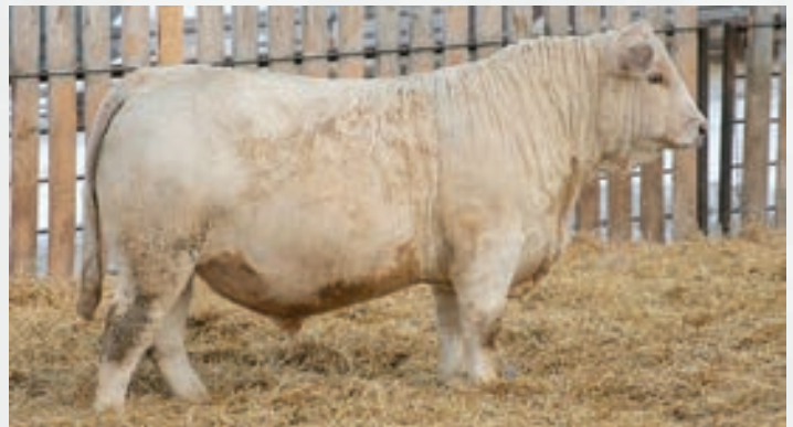
MATERNAL BROTHER DSY 801K (SELLS AS LOT 112)