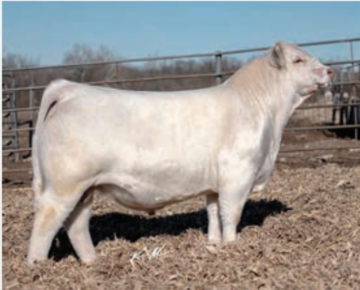
SIRE WC WHIPLASH 8298 P

CE: 14.9 // BW: -5.3 // WW: 40 // YW: 80 // MILK: 25